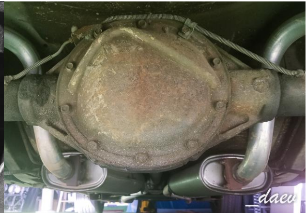
Rear end diff