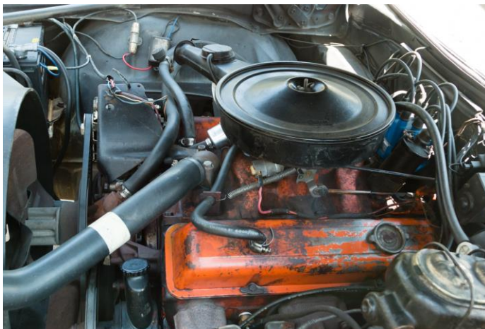
Engine compartment, view from drivers side.